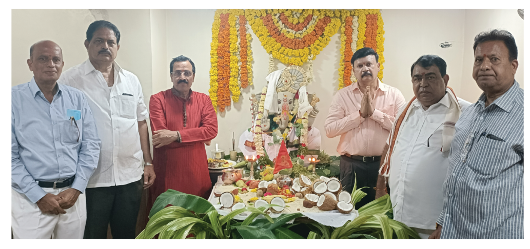
Sri Vinayaka Chavithi celebration