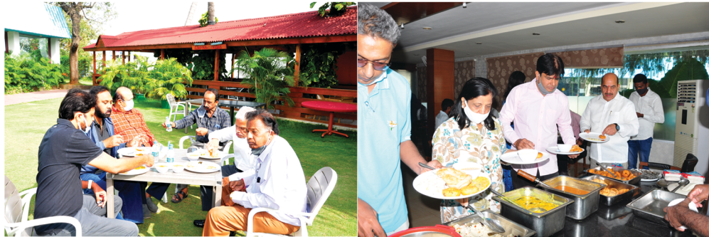
Sumptuous breakfast on the house