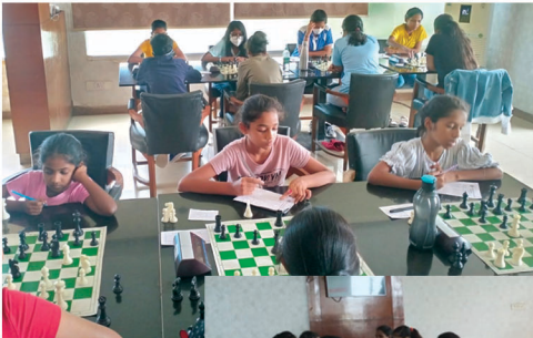
Recently the club hosted Telangana State Junior Girls Chess Championship on 3rd July 2022