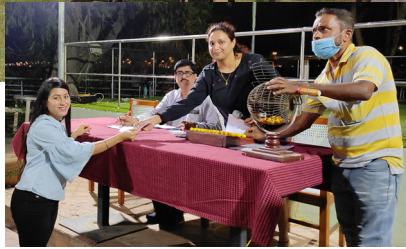
Winners of the Tambola held on 11th June 2022.